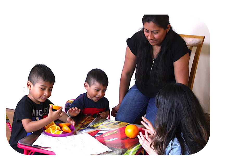
Home as a learning environment