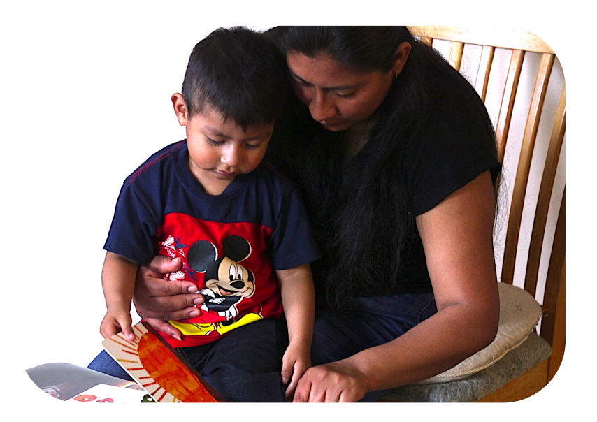
Learning experiences during play and routines